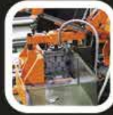
Machinery (New & Used)