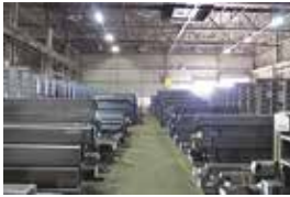
Hollow Structural Steel (HSS)