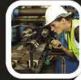
Support & Training