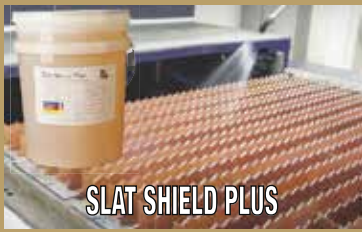
SLAT SHIELD PLUS