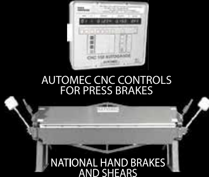
AUTOMECC CNC CONTROLS FOR PRESS BRAKES