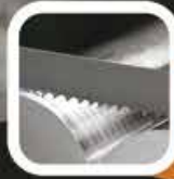
Band saw blades