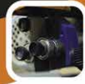
Band saw parts