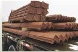
Painted Beams, Lintels and Posts