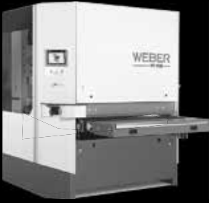
WEBER DEBURRING & EDGE FINISHING MACHINE