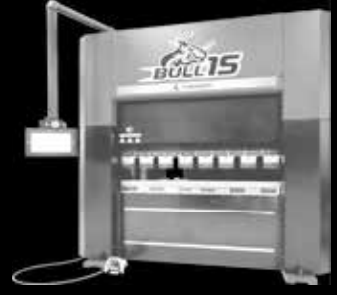
COASTONE CNC ELECTRIC PRESS BRAKES

OUR USED MACHINES LOOK AND RUN "LIKE NEW" CHECK THE WEBSITE!