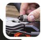
Hard to find parts