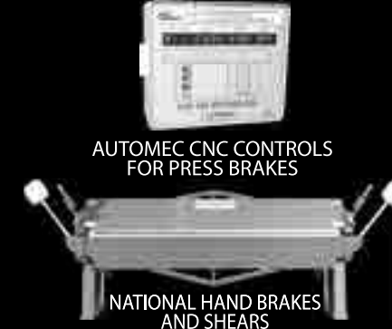
AUTOMECC CNC CONTROLS FOR PRESS BRAKES