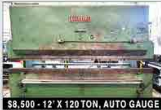
$8,500 - 12' X 120 TON, AUTO GAUGE