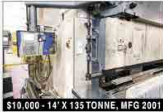
$10,000 - 14' X 135 TONNE, MFG 2001