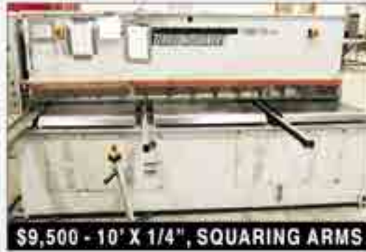
$9,500 - 10' X 1/4", SQUARING ARMS