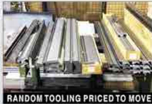
RANDOM TOOLING PRICED TO MOVE

EUROSTAMP TOOLING the Italian excellence