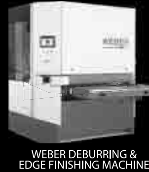
WEBER DEBURRING & EDGE FINISHING MACHINE