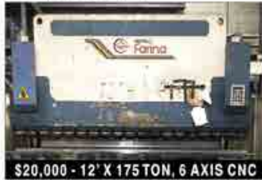
$20,000 - 12' X 175 TON, 6 AXIS CNC