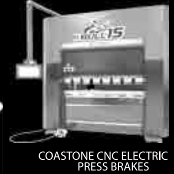
COASTONE CNC ELECTRIC PRESS BRAKES

OUR USED MACHINES LOOK AND RUN "LIKE NEW" CHECK THE WEBSITE!