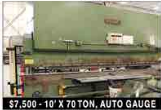
$7,500 - 10' X 70 TON, AUTO GAUGE