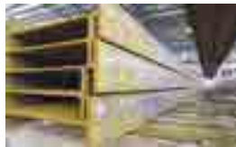
Wide Flange Beams