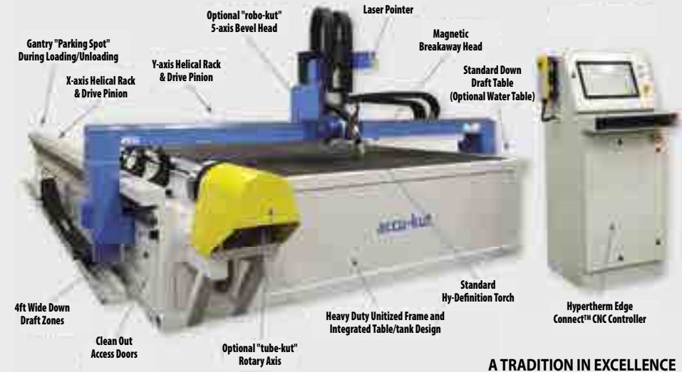
A TRADITION IN EXCELLENCE

AKS accu-kut: The "cornerstone" machine of your fab shop!