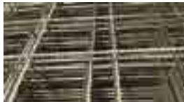
Mesh Rebar and Rolls