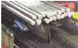
Cold Finished Bar