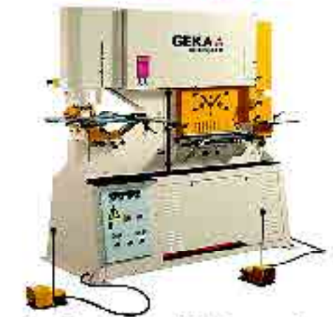
Model 85 Hydraulic Ironworker Punching, Shearing and Bending PUNCHING UP TO 48 TONS

Model 85 is available in two versions: - 5 version with a standard throat length of 12" - 5D version with an extended throat length of 20"