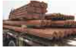
Painted Beams, Lintels and Posts