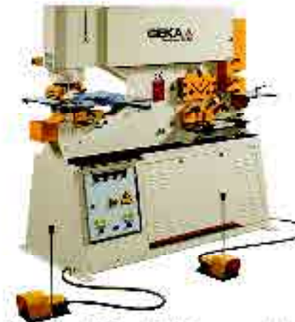
Model 60 Hydraulic Ironworker Punching and Bending PUNCHING UP TO 48 TONS

Model 60 is available in two versions: - 5 version with a standard throat length of 10" - 5D version with an extended throat length of 20"