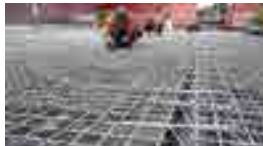
Glass Fibre Reinforced Polymer (GFRP)