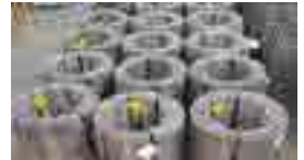
Cold Drawn Wire