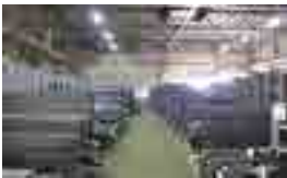
Hollow Structural Steel (HSS)