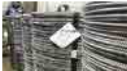
Deformed and Smooth Wire